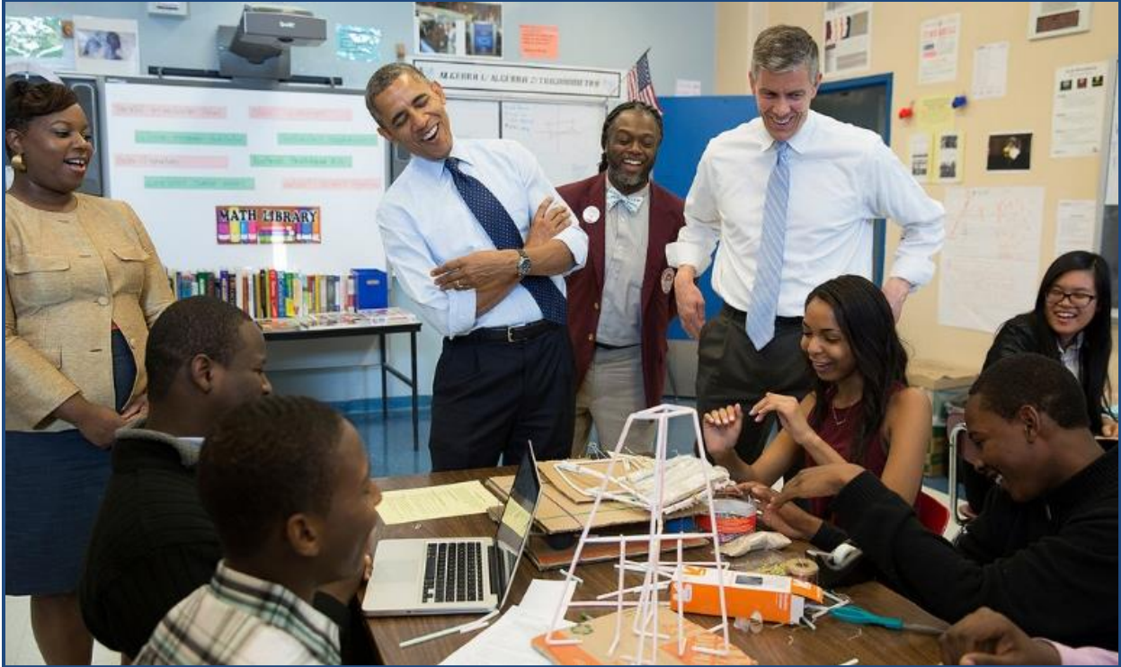
President Obama and U.S. Department of Education Secretary Duncan with students at the Technology Early College High School (P-TECH) in Brooklyn, New York, October 25, 2013.