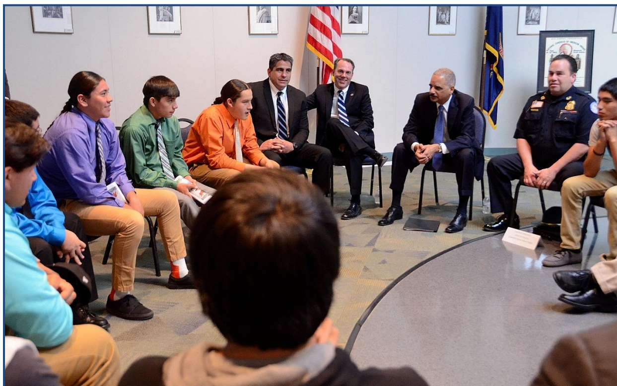
Attorney General Eric Holder meets with Indian Tribe youth in Bismarck, North Dakota, June 5, 2014.

In November 2014 , the Oneida Tribe of Indians of Wisconsin hosted the first MBK Community Challenge event in Indian country. Smoke dancers kicked off the program that included local leaders, students, and community organizations. Oneida also participated in a Native American Task Force convened by the National Congress of American Indians (NCAI) to advance the goals of the MBK initiative in Indian country.