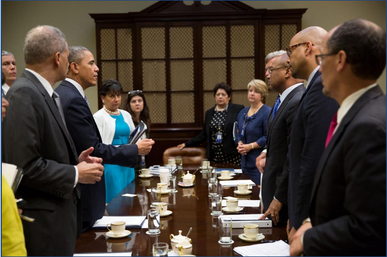
President Barack Obama meets with the My Brother's Keeper Task Force at the White House, May 30, 2014.