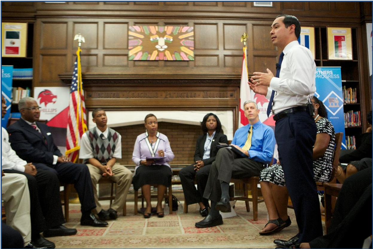
U.S. Department of Housing and Urban Development Secretary Julian Castro and U.S. Department of Education Secretary Duncan meet with Mayor Bell and community members in Birmingham, Alabama, September 9, 2014.

The Department of Education's Office for Civil Rights (OCR) is vigorously enforcing federal civil rights laws to ensure students are not inequitably disciplined based on their race, national origin, disability, or gender. OCR has recently reached robust agreements with school districts across the country to address discriminatory discipline. These agreements often include commitments to provide training for staff and administrators to recognize discriminatory discipline practices, review and revise district codes of conduct, and develop alternative discipline strategies aimed at eliminating discriminatory discipline practices and reducing the amount of instructional time missed by students.