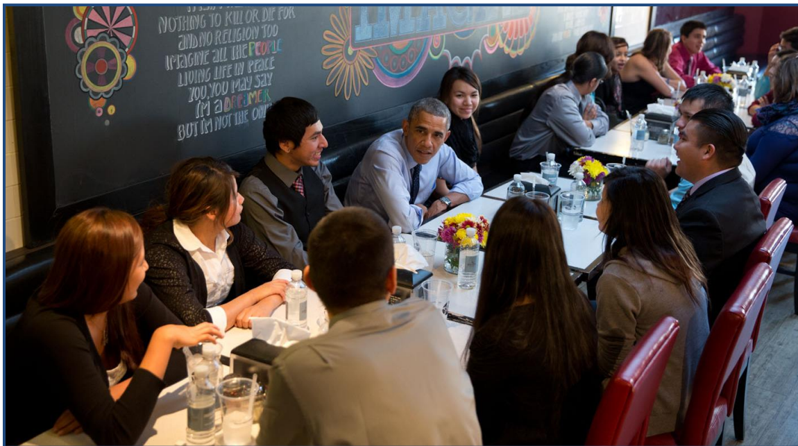
President Obama & youth from the Standing Rock Sioux Tribe in Cannon Ball, North Dakota, November 20, 2014.

In addition, the Obama Administration has been working to lead by example when it comes to the importance of mentoring. In May, when the MBK Task Force released its 90-day report, the President also called on all Americans to pledge to mentor, directing them to a place to find opportunities through serve.gov partner Mentor.org . Many accepted that call, which is now being taken to the next level by Mentor, through its independent efforts in partnership with the NBA. Additionally, the White House has renewed and expanded its own mentoring program , which has paired more youth from D.C. Public Schools with White House staff mentors. These young people and their mentors communicate on a regular basis and meet for monthly workshops and several service projects throughout the year. Some federal agencies have created their own mentoring programs. For example, the Department of Transportation (DOT) joined with an after-school tutoring program, so DOT employees can volunteer to mentor students from local schools.