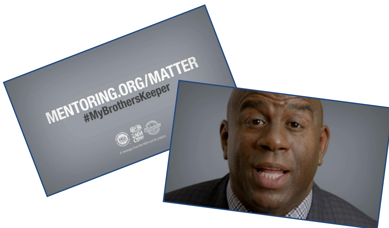
Stills from the "My Brother's Keeper: Be Someone Who Matters to Someone Who Matters" public service announcement.

Individual teams throughout the NBA are following suit and rolling out programs that amplify the NBA's overall commitment to action. For example, on January 11, the Memphis Grizzlies celebrated Mentor Night and premiered the "I Was That Kid" campaign, a player PSA initiative to support mentoring as a vital tool for student success. The campaign's call to action is one aspect of efforts to further mobilize mentor recruitment in Memphis, with a target of 5,000 new mentors by 2020. As part of the initiative, mentors and mentees will be given vouchers to enjoy healthy variations of traditional game day food.