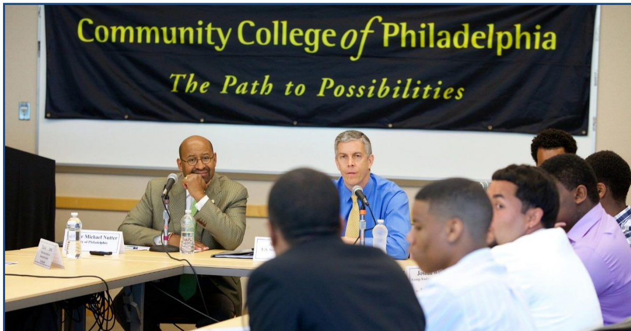
U.S. Department of Education Secretary Duncan and Mayor Michael Nutter at a My Brother’s Keeper roundtable discussion in Philadelphia, Pennsylvania, July 11, 2014.

Later in November , the city hosted the first-ever MBK Youth Hackathon at String Theory Schools in center city, Philadelphia. The nongovernmental program, supported by Qeyno Labs and #YesWeCode, drew 95 participants (ages 13-20) to form teams and build apps focused on one of five tracks: education, health and wellness, restorative justice, food and sustainability, and masculinity. Each team spent approximately 54 hours taking their idea from concept to demo, and presented before a panel of judges and their peers.