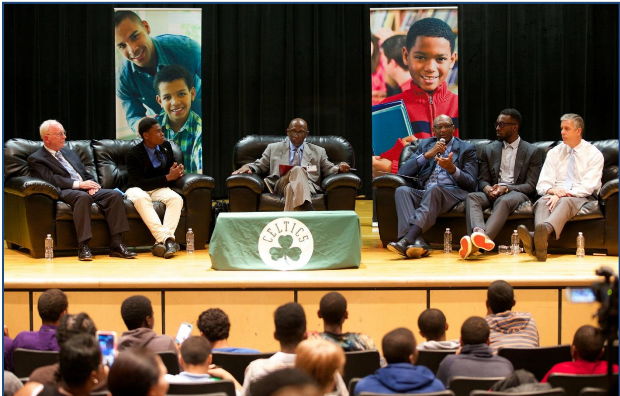
U.S. Department of Education Secretary Arne Duncan and members and staff from the Boston Celtics basketball team at a My Brother's Keeper town hall meeting in Boston, Massachusetts, September 18, 2014.

In January 2015 , Albuquerque held its local action summit in partnership with the Albuquerque Public School (APS). The summit brought together youth, community leaders, policymakers, and community members in a community conversation aimed at improving life outcomes for all youth. The feedback, comments, and information gathered at the event are now guiding the work of the district's newly formed Office of Equity and Engagement.